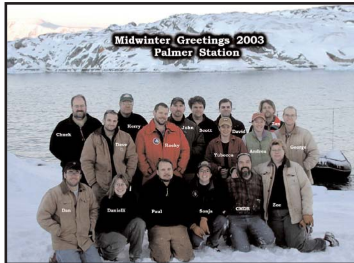
Typical winter greeting from Palmer Station. Many of the same people are back this year.

At the British Rothera Station, the entire week before Midwinter’s Day is dedicated to preparations, with all but the most necessary station duties put on hold while people plan games, go skiing and secretly work on a handmade gift for the exchange, such as picture frames made from old