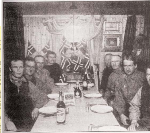
Below, the midwinter photo sent this year from the South Pole.

From the midwinter feast shared by Roald Amundsen and his crew below, to the cabled greetings sent between stations since the 1950s, Antarctic winter traditions continue.